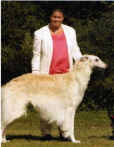
Ch. Borzoi Ch. Borzowski's Phenomenon.