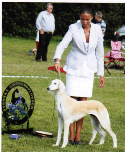
BIS 2nd, Saluki Ch. Yashars Basmira Bint Qadaa.

The Swedish Sighthound Club held its annual Skokloster Summer Show July 24-25 at Lövudden outside Västerås, little more than an hour's drive