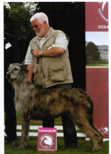
BOB Irish Wolfhound both days, Zandra von der Oelmühle.