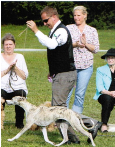
Junior in Show, Whippet Courtborne Hera.