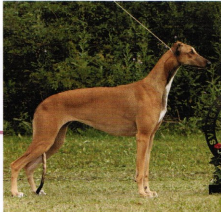
BOB Greyhound, Sobers Orianne.