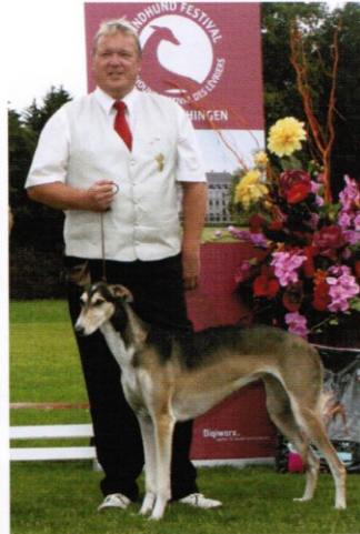
Chart Polski BOB both days, Ch. Atchafalaya Halina.