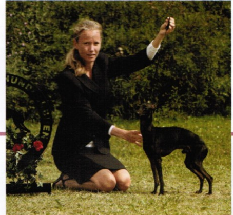
BOB Italian Greyhound Ch. Py's Lemetto.