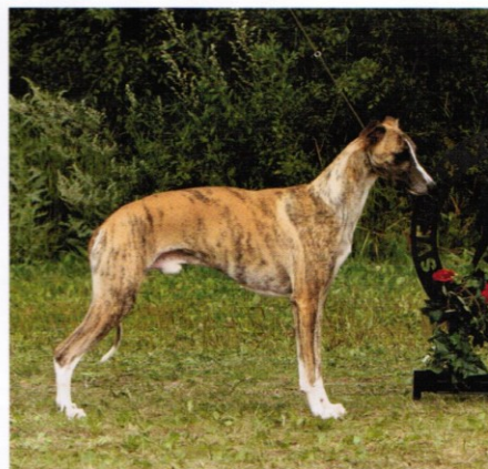
BOB Whippet Adagio Crowdstopper.