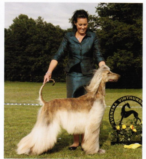
BIS 3rd, Afghan Hound Ch. Tells Chills N'Thrills.