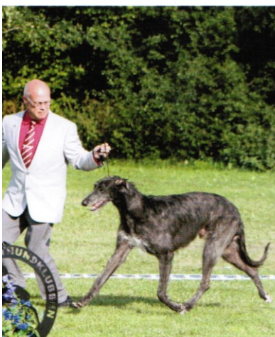
Scottish Deerhound Ch. Lehigh Fortune at iphurst.